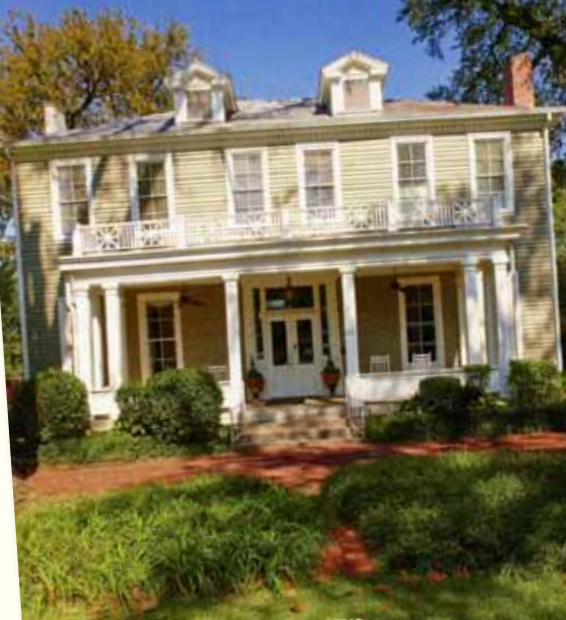
32 SOUTHERN LIVING JANUARY 2012

The witch of Yazoo City, local legend has it, avenged her death by burning the town in 1904, a tale that Morris made famous in Good Old Boy .