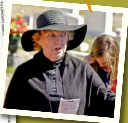
Willie Morris based many of his novels on his boyhood adventures in Yazoo City. Don't miss the mysteries that inspired him.