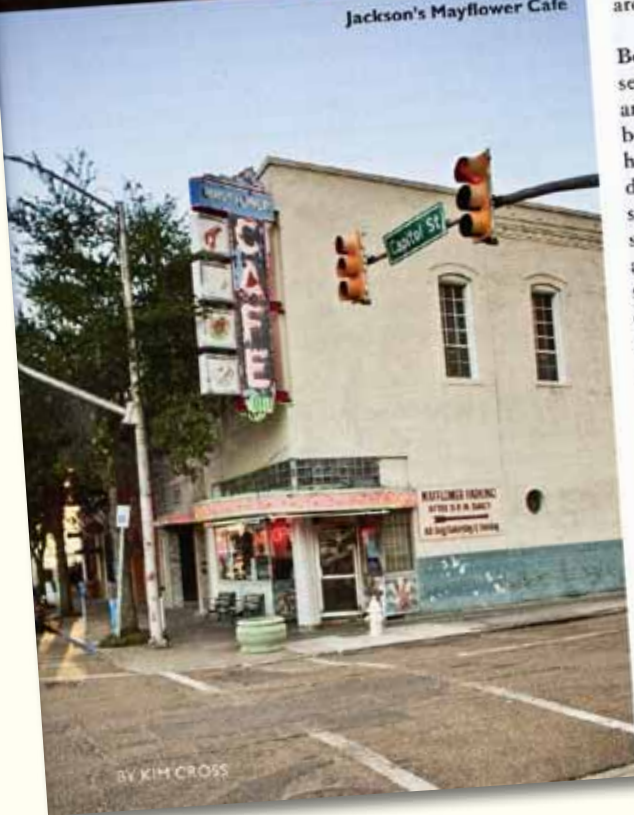
BY KIM CROSS