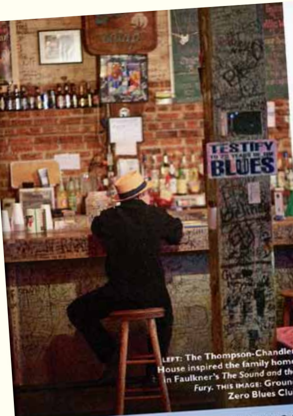
LEFT: The Thompson-Chandler House inspired the family home in Faulkner's The Sound and the Fury . THIS IMAGE: Ground Zero Blues Club