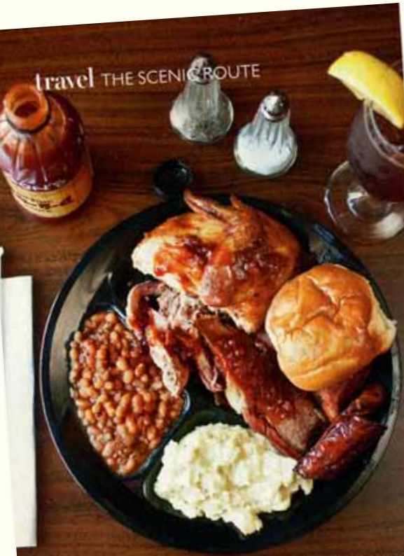
travel THE SCENIC ROUTE