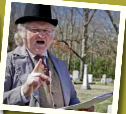
Guided tours of Glenwood Cemetery with a storyteller are available by appointment.